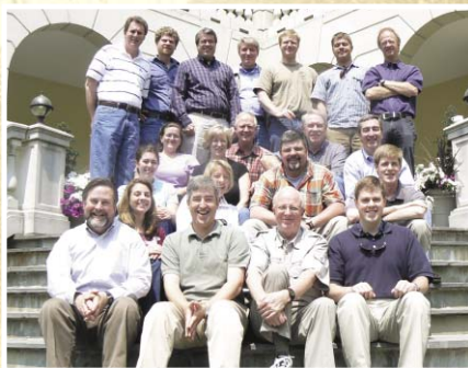
The TRCP has 26 staff members across the country working every day to address the conservation issues critical to the outdoor community.